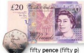
fifty pence (fifty p)

Do you know any different type of money? If yes, which?