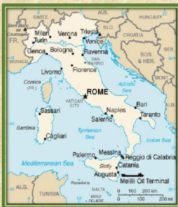
The city of Rome is the capital of Italy today Map of Italy from the CIA World Factbook

Ancient Rome was a powerful and important civilization that ruled much of _____ for nearly 1000 years. The culture of Ancient Rome was spread throughout Europe during its rule. As a result, Rome's culture still has an impact in the Western world today. The basis for much of Western culture comes from Ancient Rome, especially in areas such as government, engineering, architecture, _____, and literature.