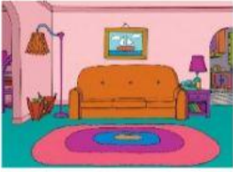
L I V I N G R O O M

A) Look at the pictures and choose the correct option.