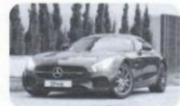
Mercedes AMG S: 300 km/h

The Lamborghini is faster than the Mercedes.