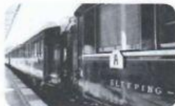
train journey: 2 days

The flight from London to Venice is shorter than the train journey.