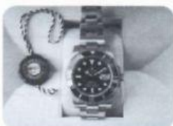
men's watch: £35,750