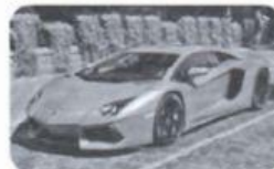
Lamborghini Aventador: 350 km/h

The country house is bigger than the town house.