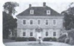
country house: 10 bedrooms

The men's watch is more expensive than the women's watch.