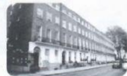
town house: 7 bedrooms

The country house is bigger than the town house.