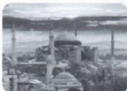
Istanbul: 805mm rain

The flight from London to Venice is shorter than the train journey.