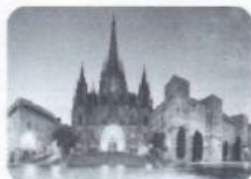
Barcelona: 640mm rain