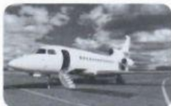
flight London to Venice: 3 hours