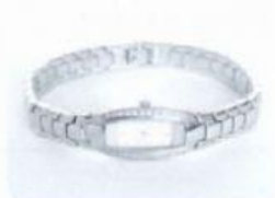
women's watch: £28,700

The men's watch is more expensive than the women's watch.