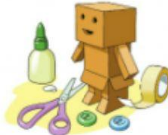
arts and crafts