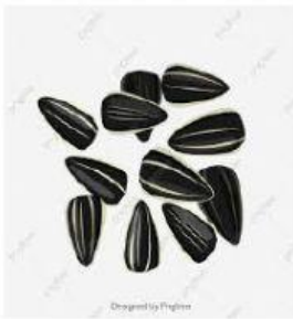
7. _ _ _ D