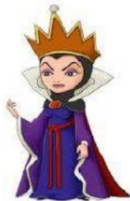
8. Q _ _ _ _