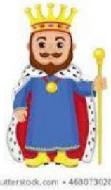
2. _ _ _ G