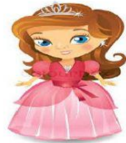
6. p _ _ _ C _ _ _