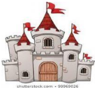
1. C _ _ _ E