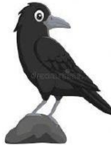
9. _ _ _ W