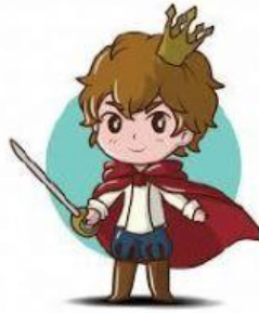
5. _ _ _ N _ _