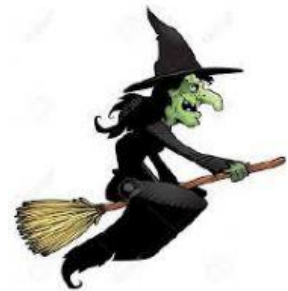
10. w _ _ _ _