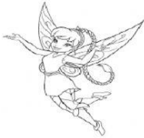
4. F _ _ _ Y