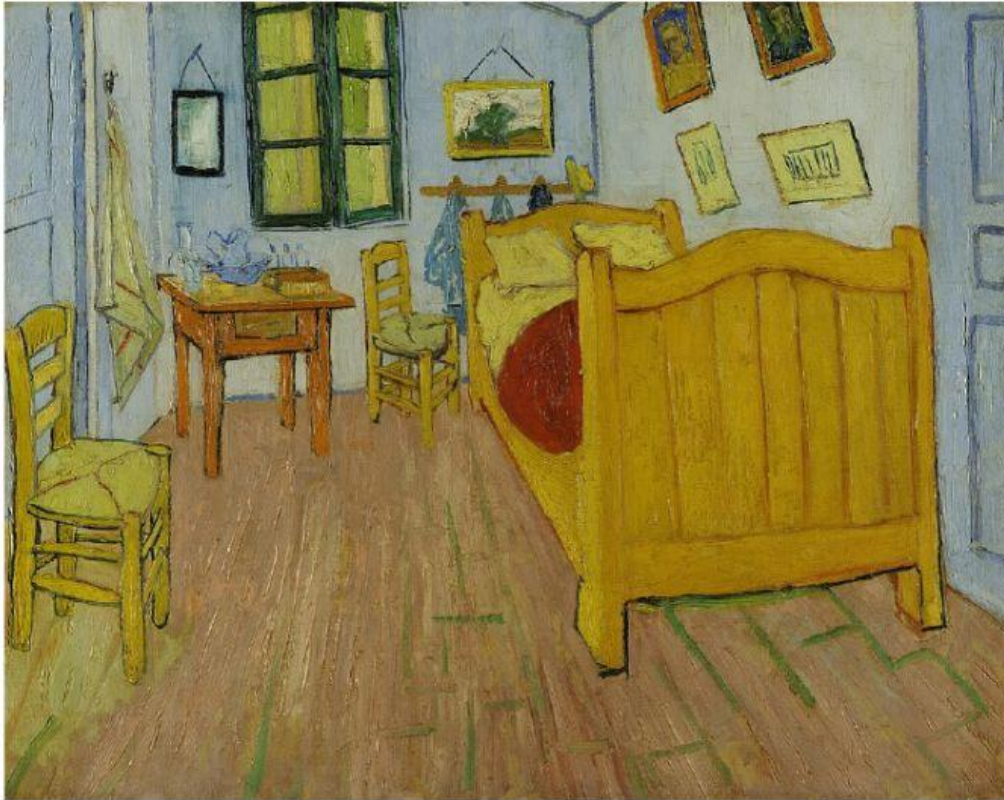
Picture - Bedroom in Arles, 1888

5. Look at the picture, write the objects and the colors that you can see on it: