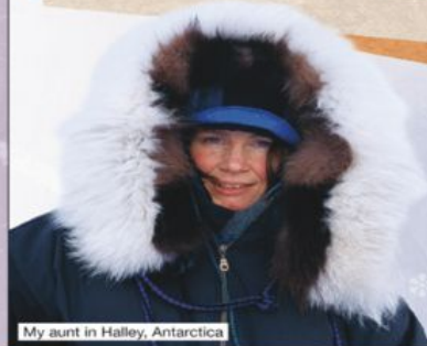
My aunt in Halley, Antarctica

My aunt is a scientist and she works in Halley, Antarctica. It's cold and very windy. It's never over 0°C in summer. In winter, it's -30°C and the wind is 150 km/h, so people wear two pairs of gloves and special boots. In this picture, it's winter and my aunt is wearing three sweaters, a hoodie, and a coat!