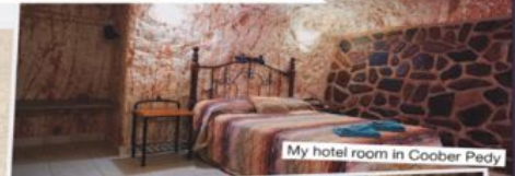
My hotel room in Coober Pedy