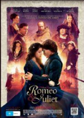
a Romeo and Juliet