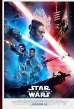
c Star Wars