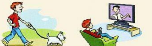
9 ..... the dog 10 ..... a DVD