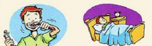
11 ..... my teeth 12 ..... to bed