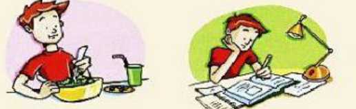
7 ..... dinner 8 ..... my homework