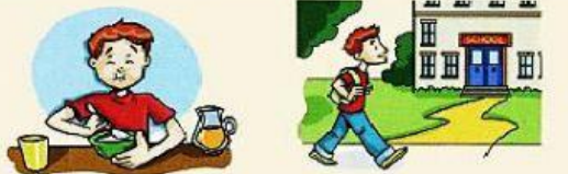
3 ..... breakfast 4 ..... to school