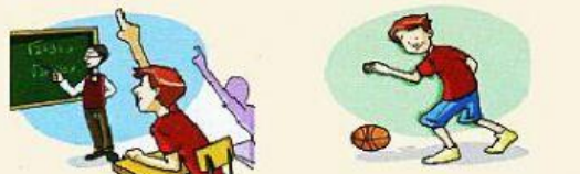
5 ..... lessons 6 ..... sport