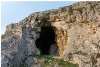
In the cave