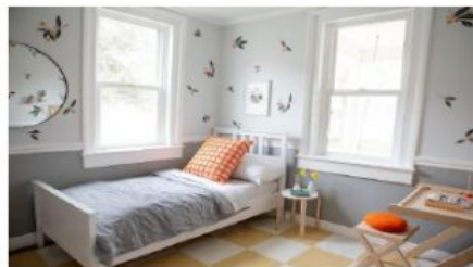
in the room