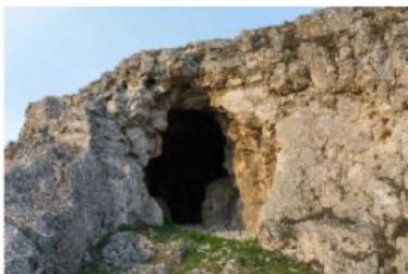
In the cave