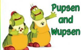
Pupsen and Wupsen