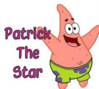
Patrick The Star