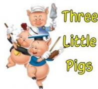
Three Little Pigs