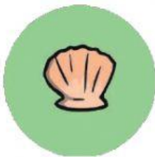
a shell from a mermaid

Feeling worn out, Holly and Jake sat down in the middle of the garden and took all of the treasures out of Holly's bag to examine them.