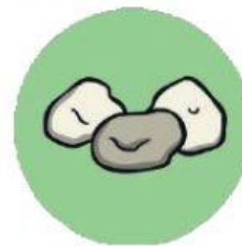
space rocks from the Moon