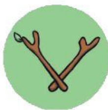
wands from a wizard