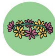
crowns from a fairy queen