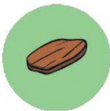
a scale from a dragon