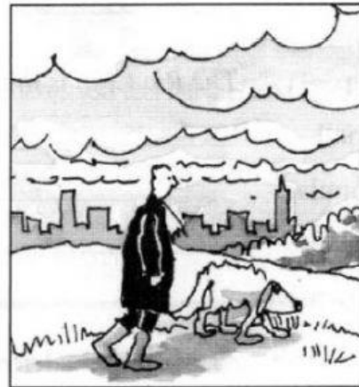
8 It's _____.