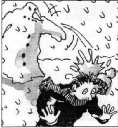
5 It's _____.