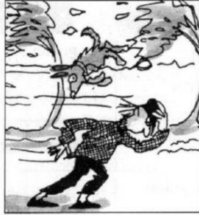
6 It's _____.