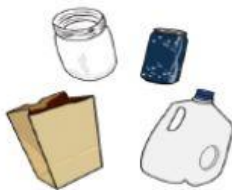
Paper & Glass

4. What are some items that can be recycled?