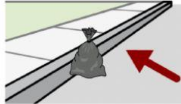
at the curb