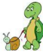
5. Mr Turtle