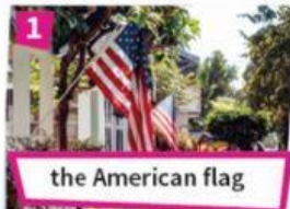
the American flag

1 Look at the photos 1-4. Listen and repeat the words.