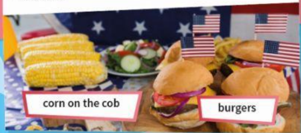
corn on the cob

Hello, I'm Jake. My favourite holiday is Independence Day. It's on 4th July. On Independence Day, we celebrate the birthday of the USA – the declaration of independence on 4th July, 1776. Some people go and see parades and hold American flags. In my family, we have a barbecue with friends. We eat burgers and corn on the cob . At night, there are fireworks.