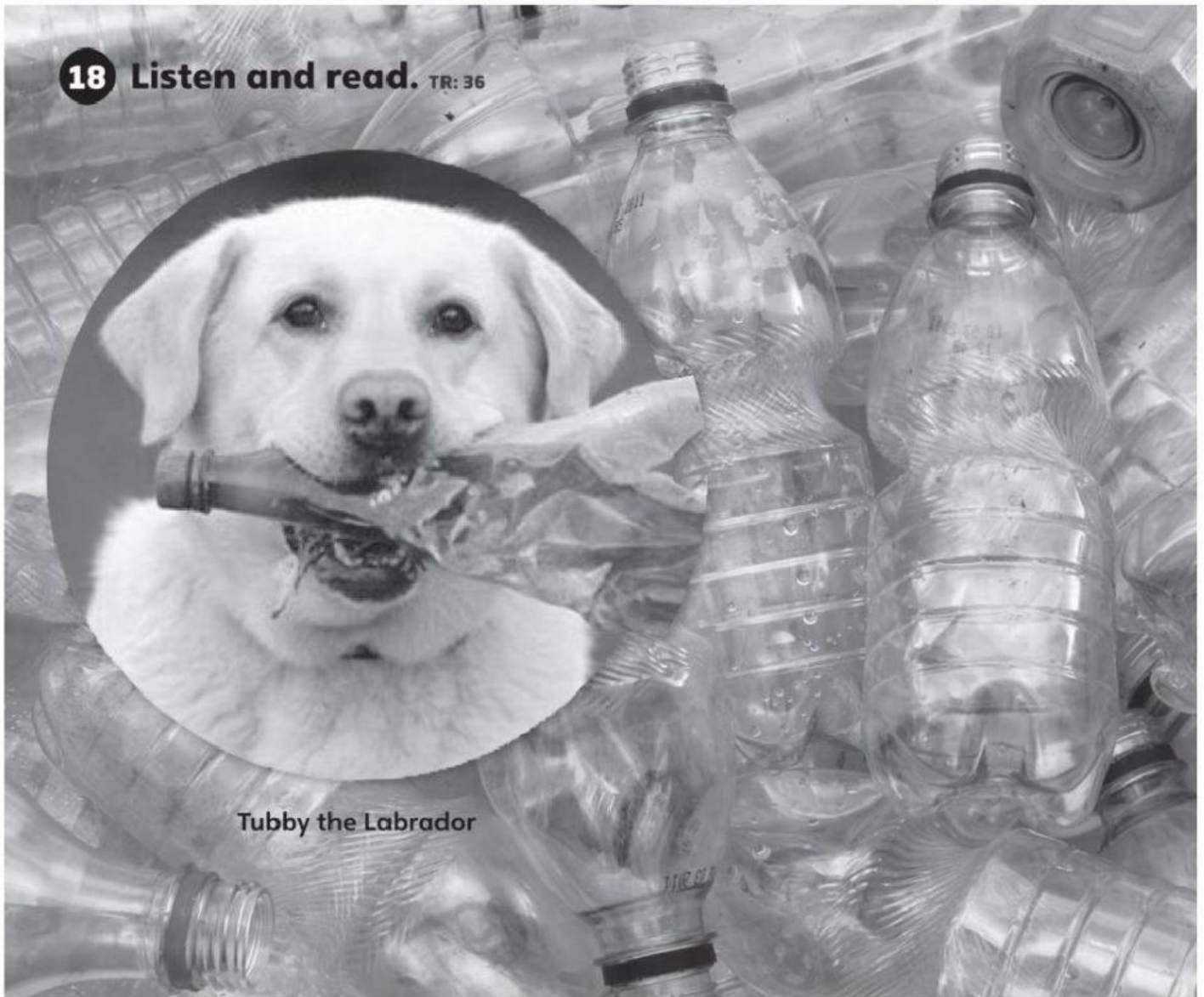
Tubby the Labrador