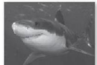
Great white shark