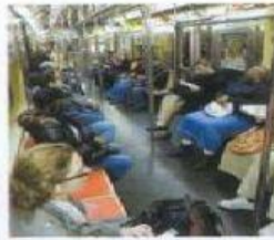
take the subway