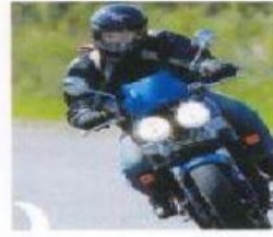
ride a motorcycle