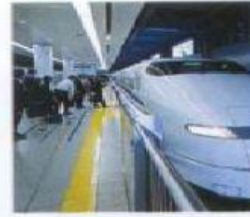
take the train