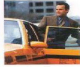
take a taxi / cab