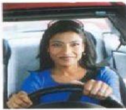
drive a car

Indication: listen to the audio by clicking on the speaker, then repeat. After that, the teacher will tell you to read each sentence.