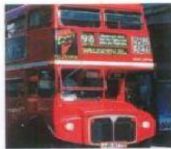
take the bus