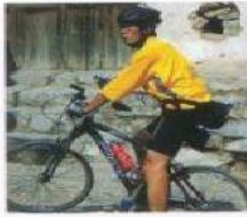
ride a bicycle / bike