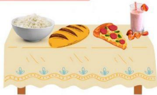
On the table