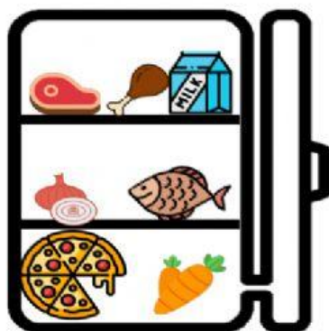
My fridge Today