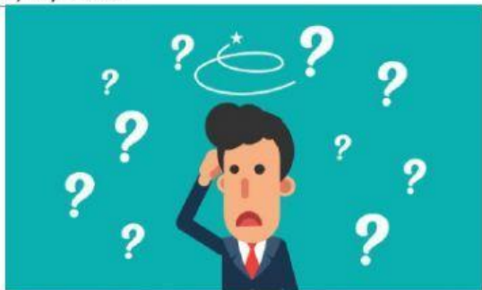
3) mess with someone's head

c) to destroy your connections, reputation, opportunities etc.