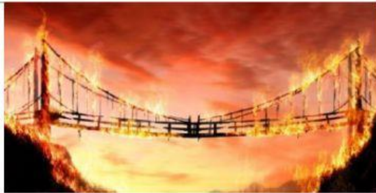
1) burn your bridges

Match each expression with its definition.