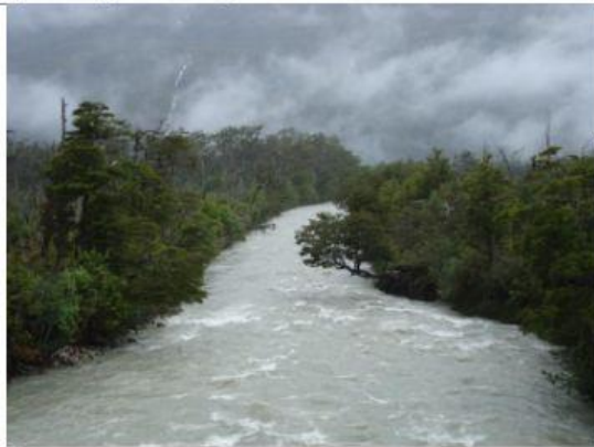
2) cry a river

a) to cry a lot, maybe to get another person's sympathy