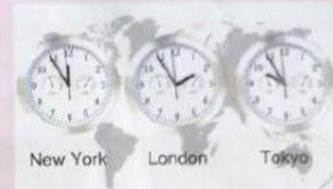
New York London Tokyo

The Meridian is also the standard for Greenwich Mean Time (GMT), against which all the world's clocks are set.