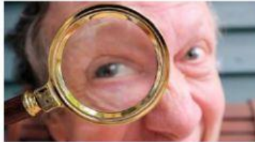
(Microsoft Clipart in the Word program used to make this document)