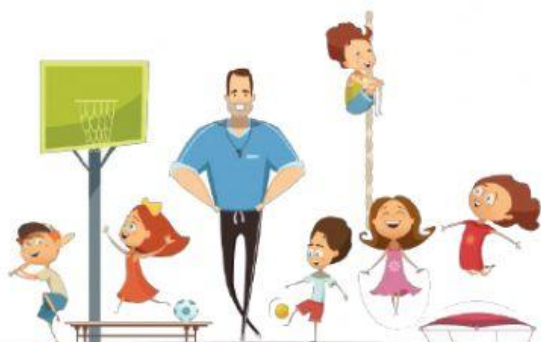
Physical Education (P.E.)