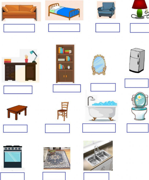
table stove bookcase bed bathtub desk mirror armchair rug chair lamp sink sofa fridge toilet