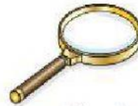
a magnifying glass