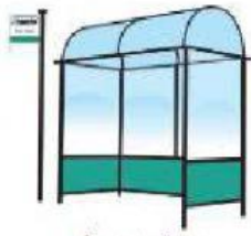
a bus stop