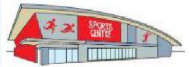
a sports centre