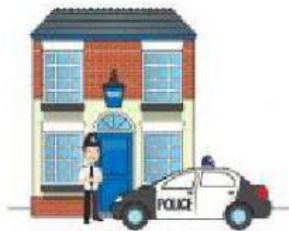
a police station