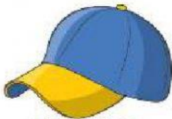
a baseball cap