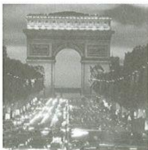
6. Arc de Triomphe _____