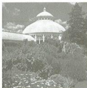
5. New York _____