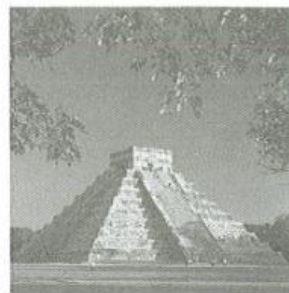
4. Chichen Itza Mayan _____