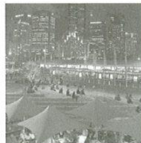
8. Federation _____

2 Complete the sentences. Write three of the places from Exercise 1.