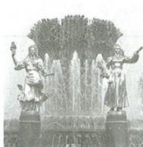
7. Friendship of the Peoples _____