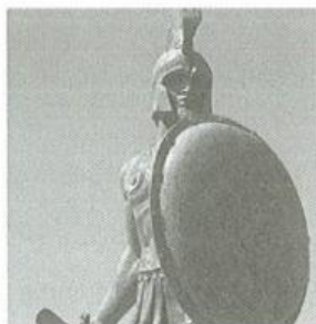
3. _____ of King Leonidas of Sparta