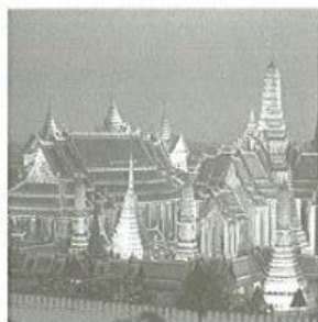
1. Grand Palace