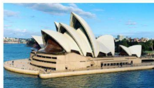
the Sydney Opera House