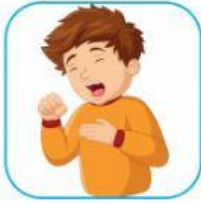
cough يكح / كحه