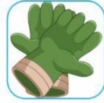
gloves قُفَّاز / جواناتي