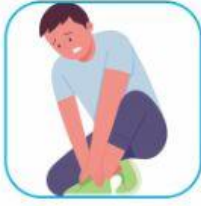
sprain التواء المفصل