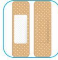
band-aid ضماده / لاصقة طبية