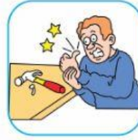
hurt يؤلم / يوجع