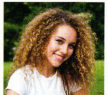
She has curly hair.