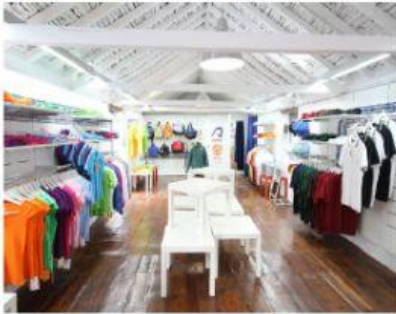
In a shop