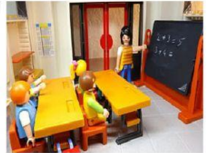
In a school

7- What year did she decide not to move from her seat in the bus?