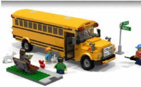
In a bus