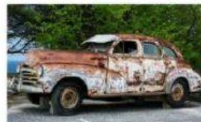
Rust forms on a car