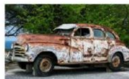
Rust forms on a car