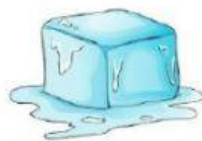
An ice cube melts