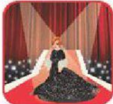
a movie star

Look and read. Choose the correct words and write them on the lines. There is one example.