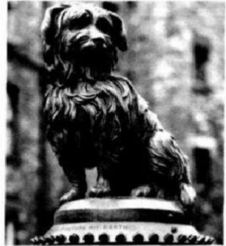
The Statue of Bobby

Bobby died more than 100 years ago, but he is still famous. Every year thousands of tourists go to Edinburgh to see Bobby's grave and his statue.