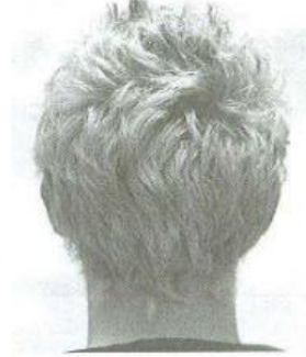
wavy blond hair