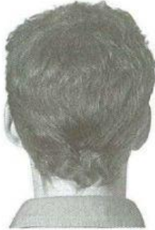
short brown hair