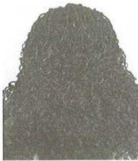
long black hair