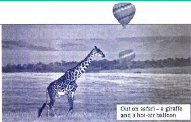
Out on safari – a giraffe and a hot-air balloon

On the last night, there was a big party and a band played traditional African music. It was great! The weather was hot and sunny all the time we were there. We had a fabulous time, and we all want to go back one day.