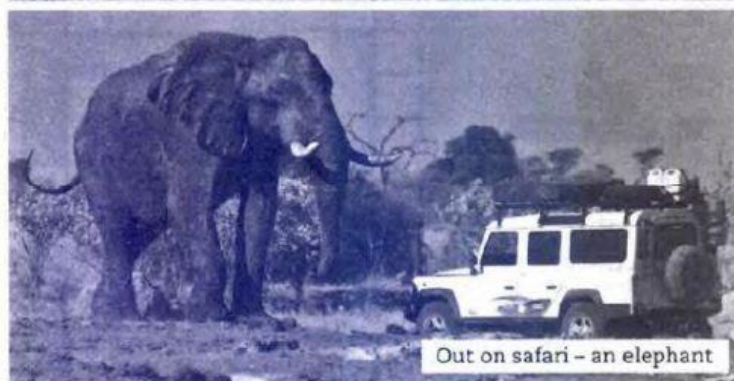
Out on safari – an elephant