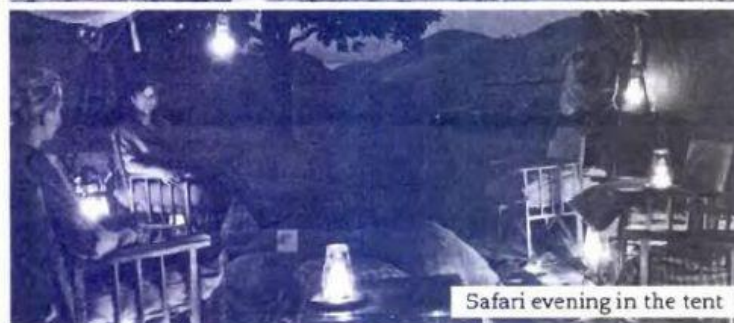
Safari evening in the tent