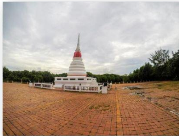
Phra Chedi Klang Nam