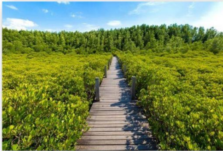
Thung Phong Thong

Thung Phong Thong is located near the origin of the Prasae River. Close to Pak Nam Krasae Sub-district Municipality, Klaeng District, is a mangrove forest by the sea That has been planted in large numbers Can look far away Hence the name is called "Thung Prong Thong" with a wooden path of approximately 2.6 kilometers that traverses Thung Prong Thong Allowing tourists to walk and take pictures with this field closely. The route will end at the Royal Prasae Warship Memorial area. Can travel all year round Open for tourists to visit every day from 6:00 am-6:00pm. Admission is free! However, there may be a deposit fee.