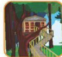
a tree house