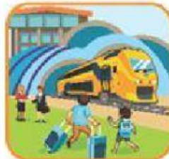
a train station