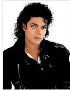
2 Michael Jackson