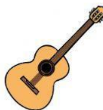
Play the guitar