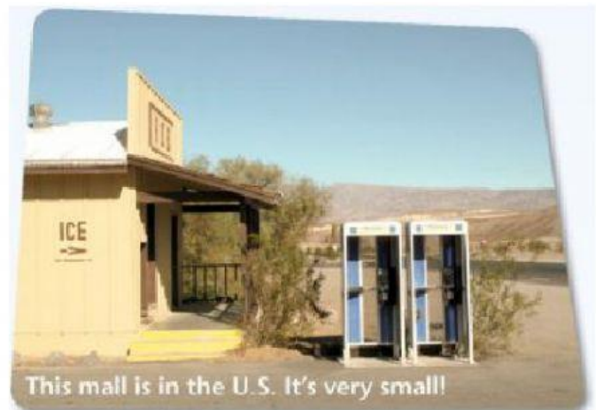
This mall is in the U.S. It's very small!