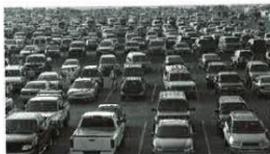
7 c pa