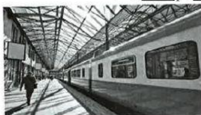
9 tra st