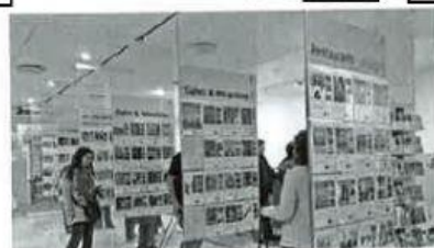
10 inf ce

2 Complete the sentences with words from Exercise 1.