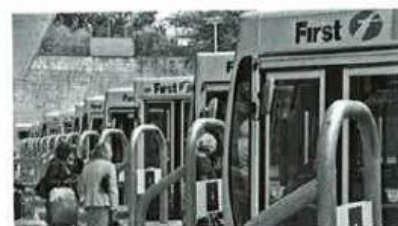
8 b st