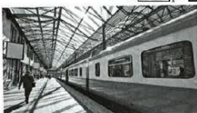
9 tra st