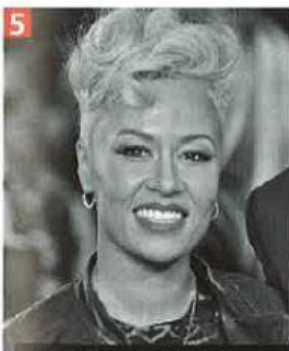
Emili Sandé, singer

Venus and Serena Williams are American. _____ parents are from the United States. _____ mother is from Michigan and _____ father is from Louisiana.