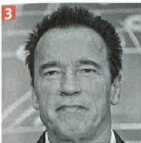
Arnold Schwarzenegger, actor and politician

I'm Sarah and this is my brother Mike. We're Australian. _____ parents are from New Zealand. _____ mother is from Queenstown and _____ father is from Wellington.