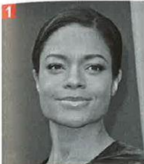
Naomie Harris, actress

7 Read about the people. Complete the paragraphs with his, her, our and their .