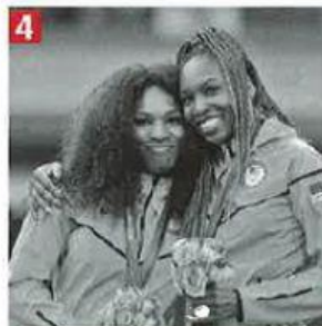
Venus and Serena Williams, tennis players

Venus and Serena Williams are American. _____ parents are from the United States. _____ mother is from Michigan and _____ father is from Louisiana.