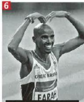
Mo Farah, athlete

Mo Farah is British. _____ father is from Great Britain. _____ mother is from Somalia.