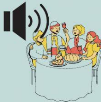
Rosh Hashannah Dinner