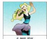
a pop star