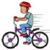
ride a bike