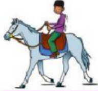
ride a horse