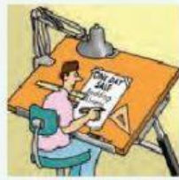
a graphic designer