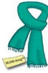
Unit 17 - 9