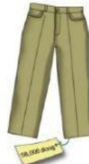
Unit 17 - 10