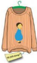
Unit 17 - 7

Task 2. Listen and answer the questions. There is one example.