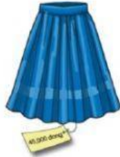
Unit 17 - 8