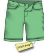
Unit 17 - 11